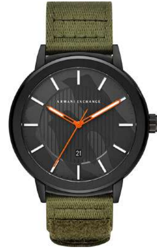
Three Hand Dial Green Nylon AX1468