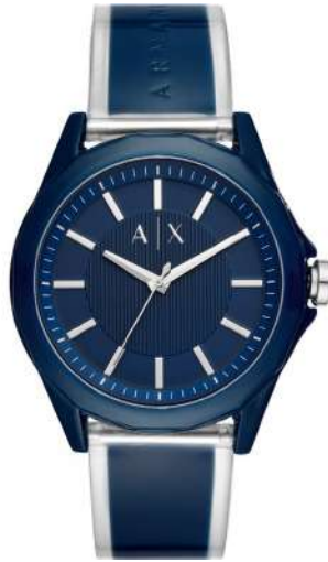
Quartz Blue Dial AX2631