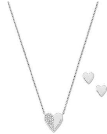
Silver Bracelet and Earrings Set