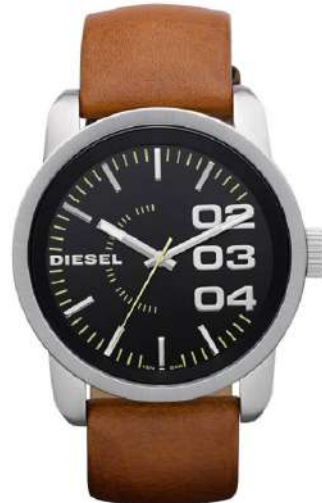
Black Dial with Brown Leather Strap