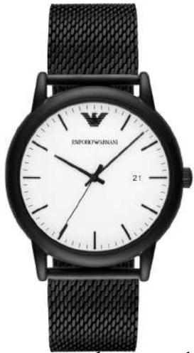
Luigi White Dial