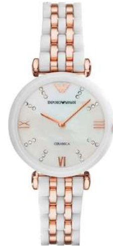
Two-Hand White Ceramic Rose- Gold Tone Stainless Steel AR1489 RRP: 429.00 Outlet: 278.00