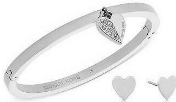
Silver Toned Bangle and Earrings