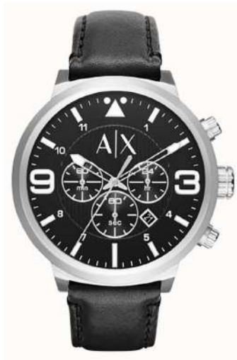
Chronograph Quartz Leather Strap AX1371