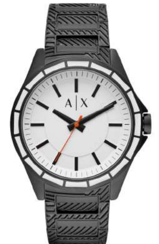
Drexler Three Hand Black Toned Stainless Steel AX2625