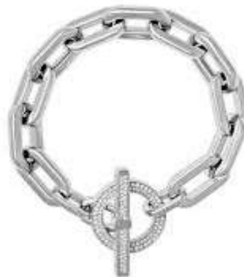
Silver Toned Toggle Bracelet MKJ4864040 RRP: 135.00 Outlet: 85.00