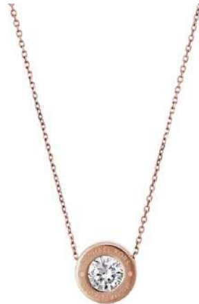
Rose Gold Circle Pendant