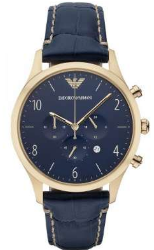
Chronograph Sport Blue