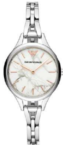
Three Hand Stainless Steel AR11167 RRP: 219.00 Outlet: 142.00