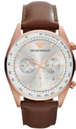
Chronograph Silver Dial