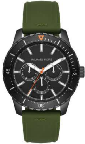
Cunningham Olive Silicone Strap