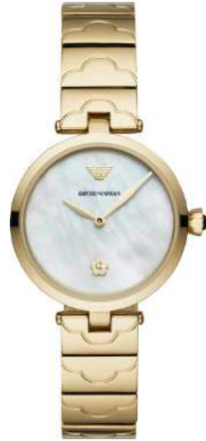
Arianna Analogue Gold Toned AR11198 RRP: 279.00 Outlet: 181.00