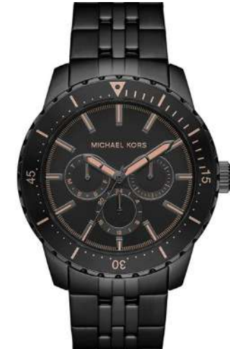
Cunningham Black Stainless Steel