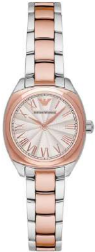
Two Hand Two Toned Stainless Steel AR1952 RRP: 279.00 Outlet: 181.00