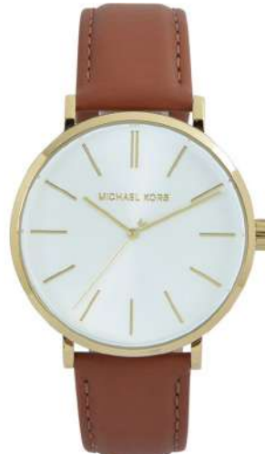
Auden Brown Leather Strap