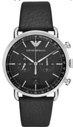
Chronograph Black Leather