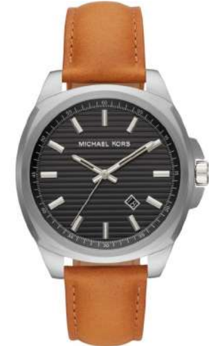
Bryson Tan Strap