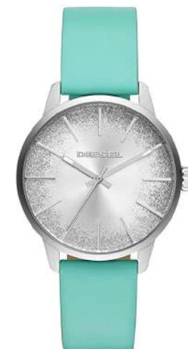
Castilia Quartz Analogue DZ5604