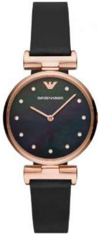
Two-Hand Reversible Black And Brown Leather AR11296 RRP: 229.00 Outlet: 161.00