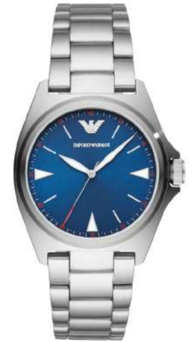
Analogue Quartz Blue Dial