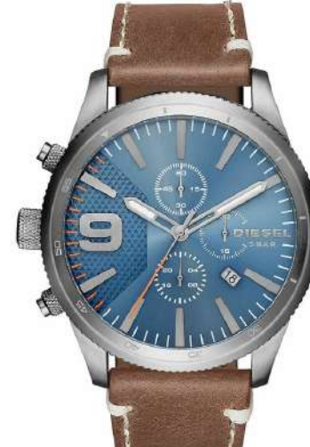
Chronograph Rasp Blue Dial