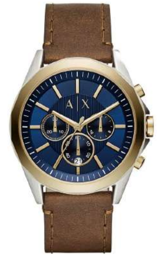
Chronograph Brown Leather AX2612