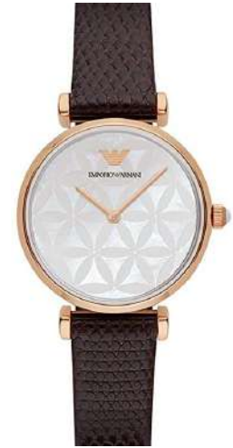
Retro Round Analogue silver dial AR1990 RRP: 229.00 Outlet: 142.00