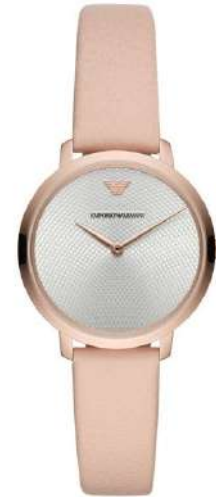
Round Analogue Silver Tone Dial AR11160 RRP: 179.00 Outlet: 109.00