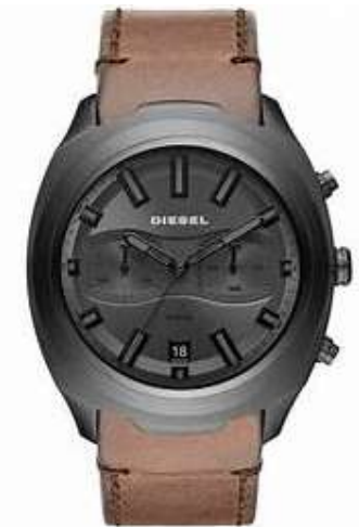
Tumbler Stainless Steel Analogue