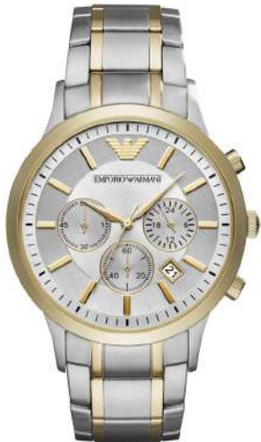
Chronograph Two Toned