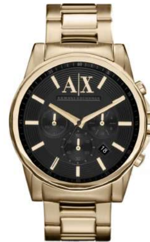
Chronograph Gold-Tone Stainless Steel AX2095