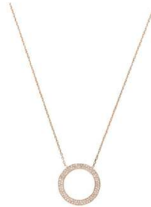
Rose Gold Circle Pendant MKJ3296791 RRP: 99.00 Outlet: 64.00