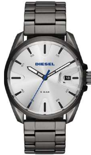
Gunmetal Stainless Steel