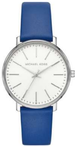
Pyper Leather Strap MK2845