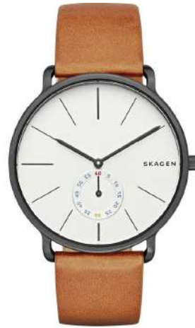
Hagen Leather SKW6273