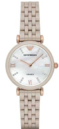
Ceramic Two-Hand Rose Gold AR1498 RRP: 429.00 Outlet: 259.00