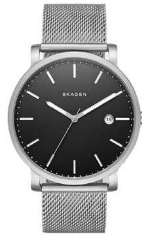
Hagen Black SKW6314