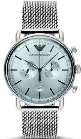
Chronograph Stainless Steel