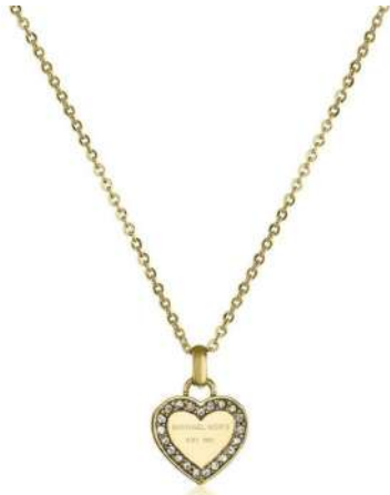
Gold Heart Pendant