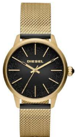
Castilia Gold DZ5576