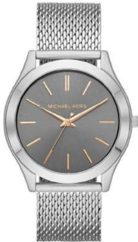
Slim Runway Silver Mesh