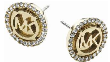
Gold MK Studs MKJ2941710 RRP: 69.00 Outlet: 44.00