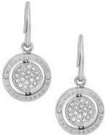
Silver Diamond Drop MKJ5651040 RRP: 89.00 Outlet: 57.00